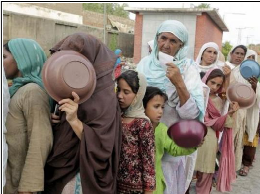
Girls and women displaced by the 2010 floods wait in a queue for food in Nowshehra.

Humanitarian action in Pakistan in general needs to be more firmly grounded in the principle of gender equality and women need to be equally consulted and engaged in the decision-making process. It is also important to ensure an enabling environment in camps so that women feel able to raise protection and assistance concerns.