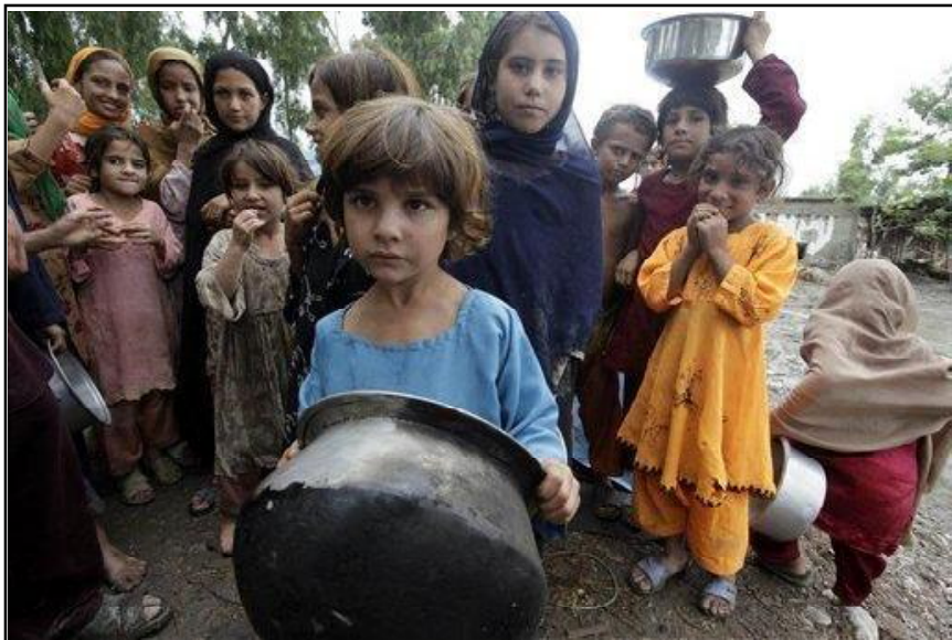
Securing food and other provisions often took up most of the time of displaced children.

legislation, children are guaranteed many rights under the national constitution and under the Convention on the Rights of the Child (CRC), to which Pakistan is a signatory.