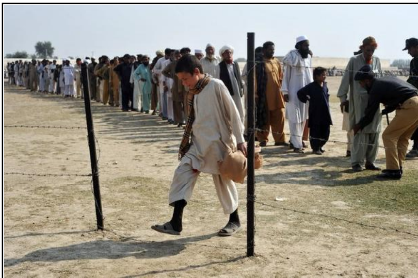
Displaced men form a queue as a policeman frisks them for weapons before registration.

obvious advantages in terms of integrated response, avoiding duplication of efforts and guarding against scenarios where some areas have excess of assistance while others may not get any at all.