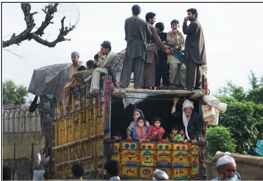
IDPs from Malakand on their way to Swabi.

The number of internally displaced persons in the country shot up between July and September 2010 after the worst flooding to hit the country in living memory affected 20 million people. The floods caused large-scale devastation across the country and forced 7 million people to leave their homes. 22