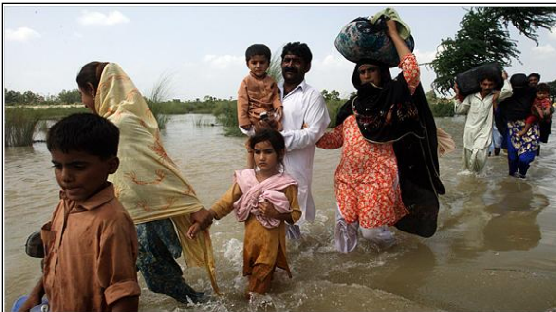
A familiar sight in Pakistan in the summer of 2010 as millions were forced from their homes by the floods.

prevent displacement from occurring and, at times, to cushion the displaced from the impact.